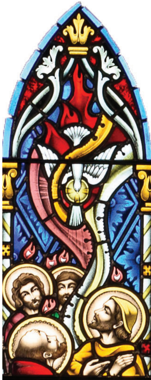
Detail from the Pentecost window in the Chapel of the Holy Spirit.